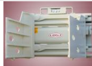
Cage block clamps