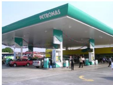
Indonesia Petrol station