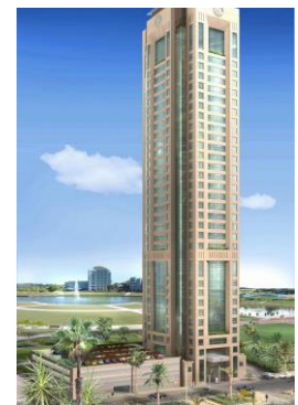
Al Habtoor Business Tower Dubai