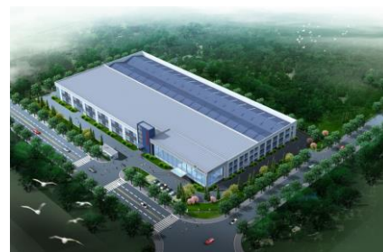
Our factory picture

ALCLAD® surfaces can be attached to one another or to other materials by conventional methods of attachment - rivets, bolts or screws. For interior installation, flat surfaces of ALCLAD® can be attached to substrates such as gypsum board using double-faced tape or non-hardening adhesive.