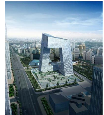
Beijing CCTV Mansion