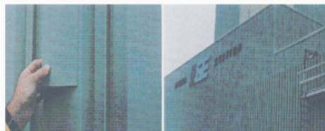
GINNA Nuclear Power Station, built in 1967, used PVDF coating and keep integrity of the coating for near 40 years.

Highly durable PVDF coatings have provided long-term beautification of metal building panels and components for near 40 years.